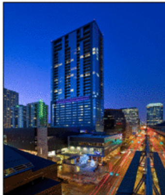
W Austin Hotel & Residences / Austin City Limits Live

The strong Austin economy supports continued asset value growth