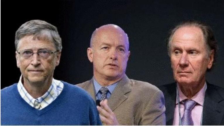
Bill Gates, David Sokol and David Bonderman have taken the hedge fund path of activism.

A threat to oust a company's board. A pair of scathing letters accusing a chief executive of being a liar and thief. A company complaining about the cost of fighting off a dissident shareholder. Just another week in the battle between corporate America and activist hedge funds, you might think.